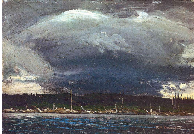
"Thunderhead", Tom Thomson